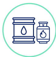
Clinical and hazardous waste