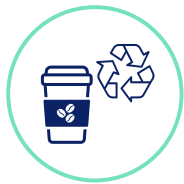
Coffee cup recycling