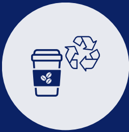
Coffee cup recycling