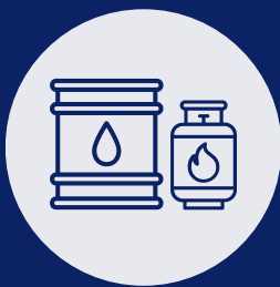
Clinical and hazardous waste